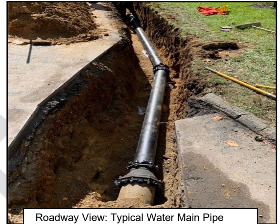
Roadway View: Typical Water Main Pipe