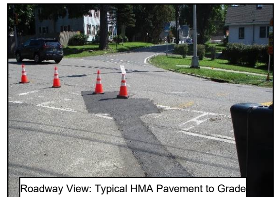
Roadway View: Typical HMA Pavement to Grade