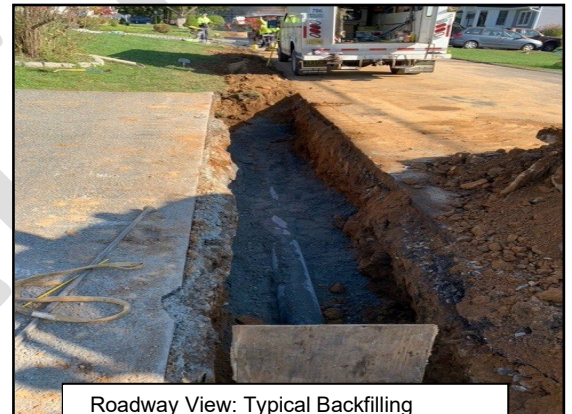
Roadway View: Typical Backfilling